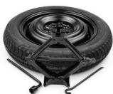
Spare Tire, Jack & Tire Iron